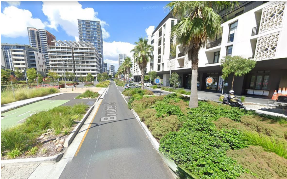
View from Lachlan Avenue facing south along Gadigal Avenue